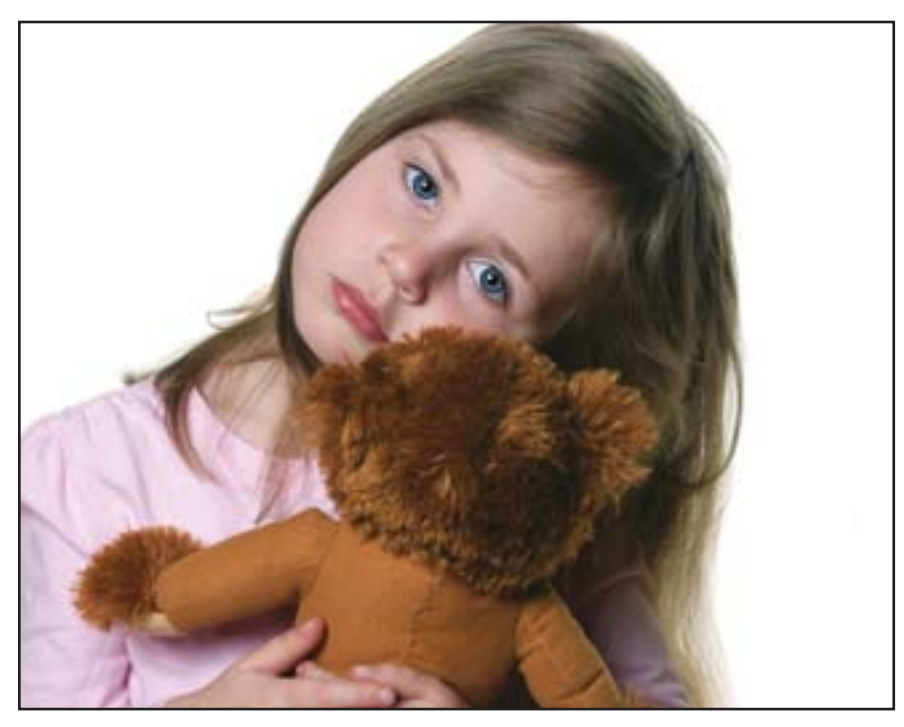
Evidence-informed practice has its roots firmly in social care, where the service user/consumer perspective is as important as the research evidence and where policy is seen to have a powerful impact on the nature of interventions.

Published research is not always easy to access, either physically or in terms of understanding. Two ways of developing more accessible information are to translating the research into CAPS and CATs. CAPs are Critically Appraised Papers, which consist of two parts, the first part is a detailed summary of the research paper and the second (more critical part) is a commentary on the rigour and usefulness of the research for practice, usually written by an experienced clinician. Examples of OT CAPS can be found in the Australian Journal of Occupational Therapy. CATs are Critically Appraised Topics, these are similar in structure and process to systematic reviews although less rigorous. A CAT focuses on a clear clinical question and presents an overview of the search strategy as well as a summary of the evidence that was found and concludes with a statement in terms of the best evidence for the topics (e.g. There is evidence from one RCT that an energy conservation course run by an occupational therapist decreased the impact of fatigue by seven percent in persons with multiple sclerosis, www.otcats.com-/topics/CAT - Tammy Filby 12 Nov.html (accessed 23/10/09). A variety of OT relevant CATs can be found online at otcats.com.